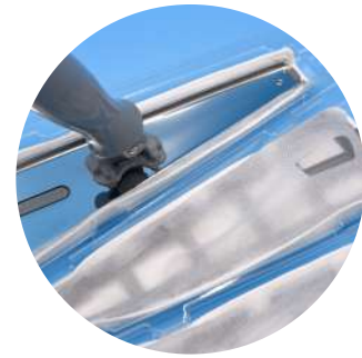
Touch-free pad attachment and removal