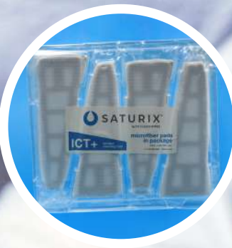
Used-pad storage within the hood