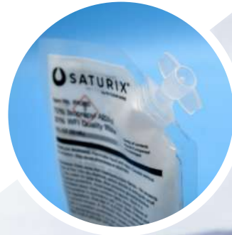
Precision dosing of pads in package